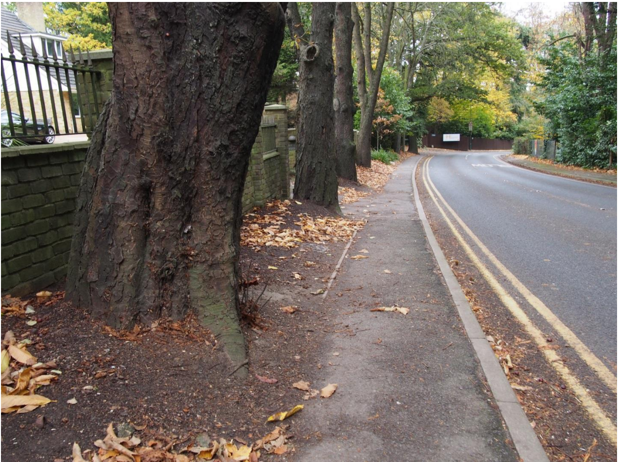
Figure A2.6 – Devenish Road Between Jersey Place & Hancock's Mount